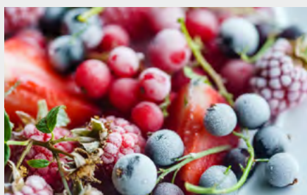
Temperature controlled shipments