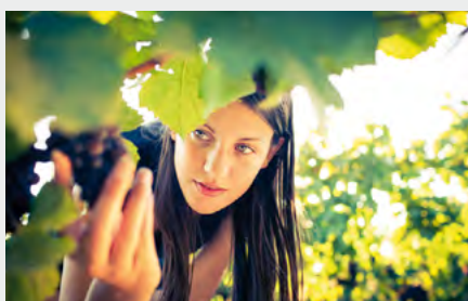
Transparency and documentation