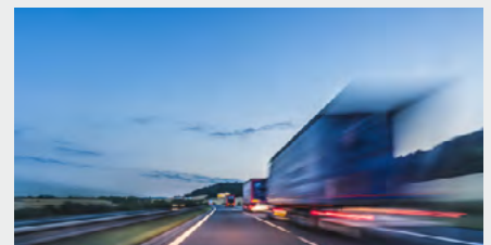
Pre-and on-carriage: everything remains in one hand