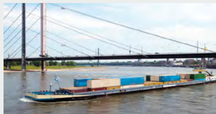
Combined road and water transport

No traffic congestion, significantly fewer emissions than road transport, optimum value for money: with short sea shipping, your goods travel economically with minimum environmental impact. Short sea shipping on just one ship replaces around 130 trucks. These departures are scheduled and can therefore be optimally integrated into our transport chains.